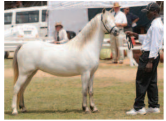
Paddock Hill Sun Frolic

three ponies competing together in Supreme Championships. So at Heidelberg in 2010 Sun Coquet, Sun Frolic and Sun Kissed competed against each other in the Supremes as did Sun Coquet and Sun Kissed in the National Supremes this year.