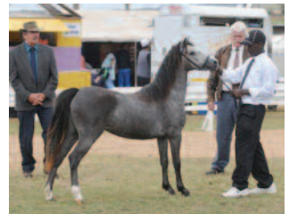
Paddock Hill Sun Kissed