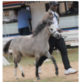
Paddock Hill Sweet Augusta