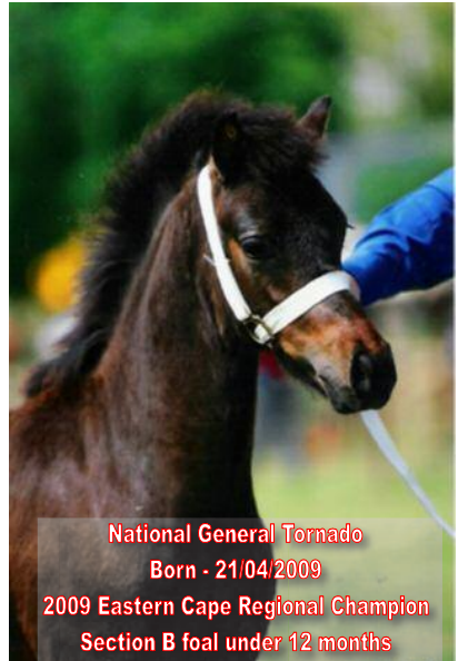
National General Tornado