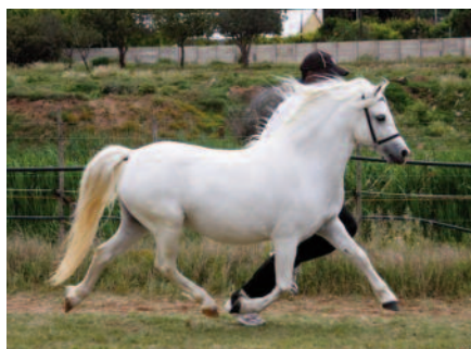
Paddock Hill Sun Coquet.

At the Western Cape Regionals, Llandilo Sabre, belonging to Paddock Hill, won the Sec A Senior Champion Stallion class, the Section A Supreme Champion class, and was the Western Cape Supreme Champion Welsh Pony.